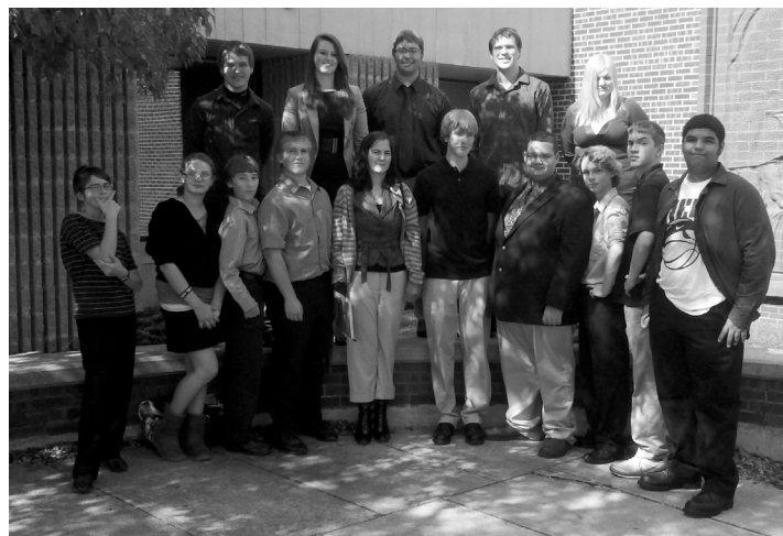
Above: Model UN students who traveled to the Iowa Youth Symposium pose for a picture.

The class will have another chance to learn at the farm later on this year, performing the same tasks.